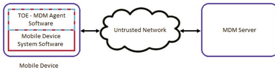
Figure 1: MDM Agent Operating Environment

Figure 1 shows a high-level example of the PP-Module TOE boundary and its Operational Environment. As stated above, the MDM Agent may either be provided as part of the mobile device itself (shown in red) or distributed as a third-party application from the developer of the MDM Server software (shown in blue).